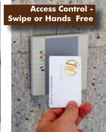
Access Control - Swipe or Hands Free